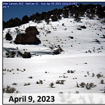
April 9, 2023

A very wet 2023 water year impacted many field sites where GBRRU researchers and collaborators conduct research. Porter Canyon Experimental Watershed was no exception. The snow melt runoff in early spring, recorded by a SNOTEL station, measured 29 inches of snowmelt in just 17 days. Our on site phenocams captured the rapid snow melt that occurred (photo right). The only road to the Porter study sites, through a narrow canyon at the mouth of the watershed, completely washed out (Photo far right). Washouts and head cuts proved to be a big problem this year at many sites, and the GBRRU team have had to often hike in to record data until the roads can be repaired.