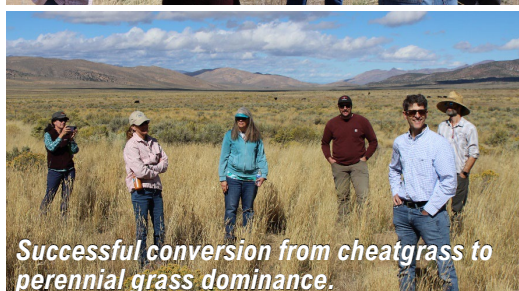
Successful conversion from cheatgrass to perennial grass dominance.