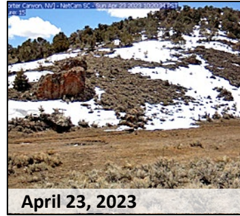
April 23, 2023